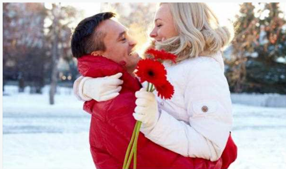
PheromonesHuman PheromonesAndrostenoneBuy Human PheromonesAttract

Using human pheromones can have negative side effects. While proper usage can have a desirable and help create the attraction between sexes, too much usage can cause negative behavioral changes in the individual deploying it plus the people close to him. This overdose can cause irritation and sudden unexplained bursts of frustration to be able to the people using it or perhaps are exposed to it. Therefore you ought to be careful of the amount of pheromone they put on their bodies.