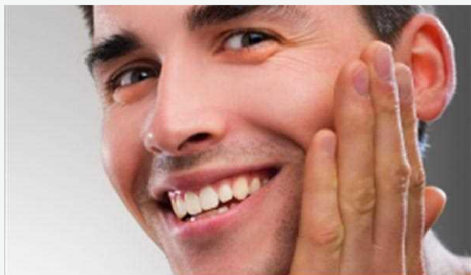
PheromonesBuy PheromonesSynthetic PheromonesHighly EffectiveAndrostenone