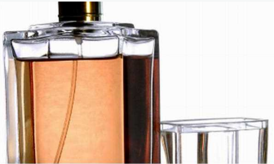
Pheromone Cologne Pheromones Physical Attraction Pheromone

Your level of confidence, dreams, wants as well as the urge to have physical contact with the woman you imagine are going to be happy with this phenomenal pheromone cologne. There is a variety of pheromone to suit your needs, like, spray, cologne, fragrant, unscented, mist etc. It's got profoundly helped to build strong physical relationships too has improved the level of intimacy in order to reach the maximum while performing the particular sex act. It has additionally helped a lot of people who lack in libido or have any kind of sexual deficiency since pheromone triggers your hormones that play major role in arousing your partner as well as yourself.