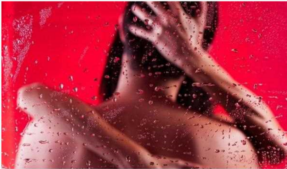
Pheromone Cologne Pheromones Pheromone Product Reviews Pheromone

They are used by all people from all walks of life in order to be able to find the person who are meant for them. Looking good and feeling about yourself is the first step toward developing a good relationship with the opposite sex. These are the main factors that you need so that people will notice your presence. A pheromone cologne is an effective tool in bringing out the best in you and perhaps draw out your amazing sex appeal .