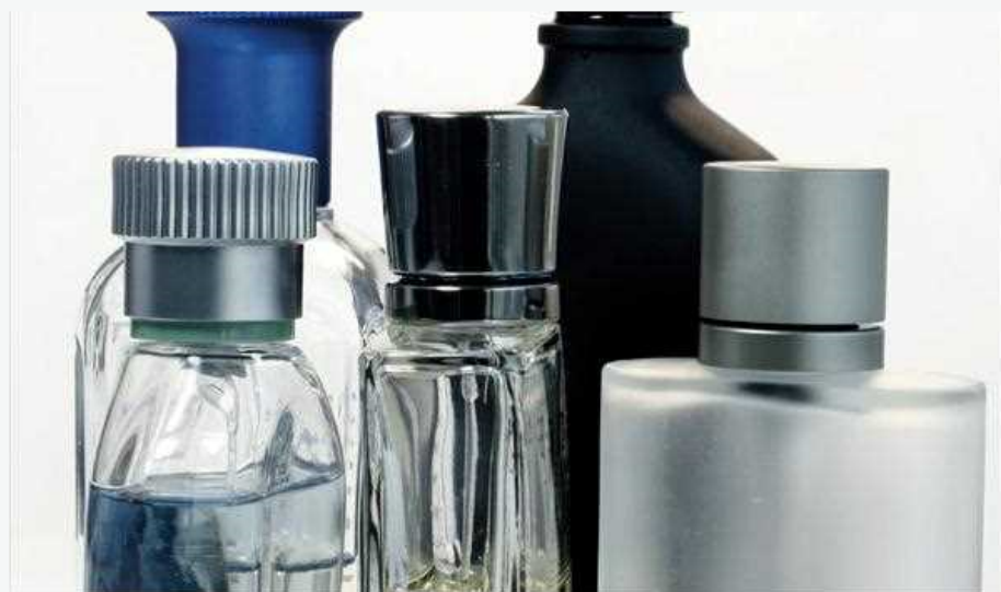
Pheromones Synthetic Pheromones Natural Pheromones

The chemical formula I personally use in order to step-up my fascination factor is known as synthetic pheromones . This is a natural chemical attractant that we people are able to create thru the sweat glands, as well as the synthetic version is designed to considerably enhance our organic pheromones signature.