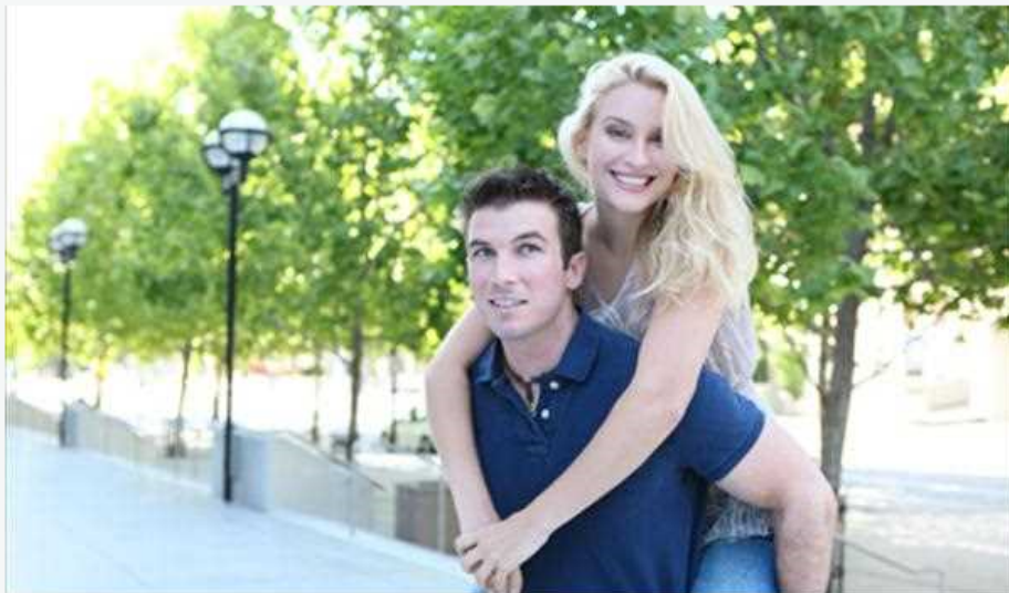
PheromonesPheromone SprayPheromone FragrancePheromax

It's the "pheromone perfume of girls" and in case you are thinking why, i want to inform you. Copulins are pheromones that ladies produce themselves. It's been identified to effectively attract males. In case you have ever puzzled exactly why males are usually so drawn to be able to you throughout menstruation, then you've simply known the attraction of pheromones at its best.