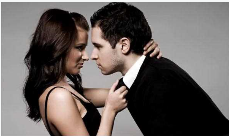
Pheromones Sexual Attraction Favorite Perfume Human Pheromones

As the sense of smell could recollect probably the most vivid of memories, it is this excellent scent of a woman combined with her perfume that people tend to remember most when thinking about that person. Men will often buy the same perfume for a woman actually years after she has ceased using it because it is the scent they have come to identify with that woman.