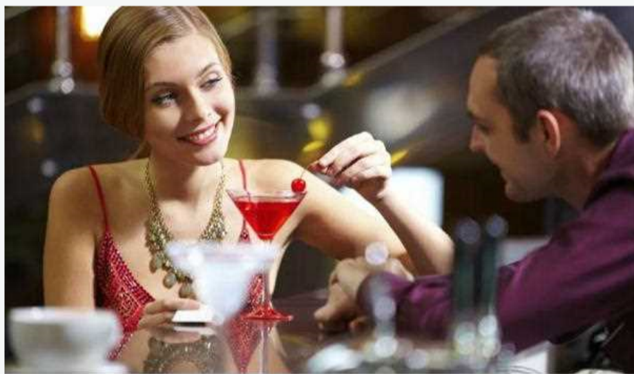
Pheromones Androstenone Human Pheromones Attract Women Sexually

To get additional respect, therefore appearing more domineering or intimidating. Patented regarding improving debt collection by spraying the final demands - not only do more people pay up, they also pay quicker.