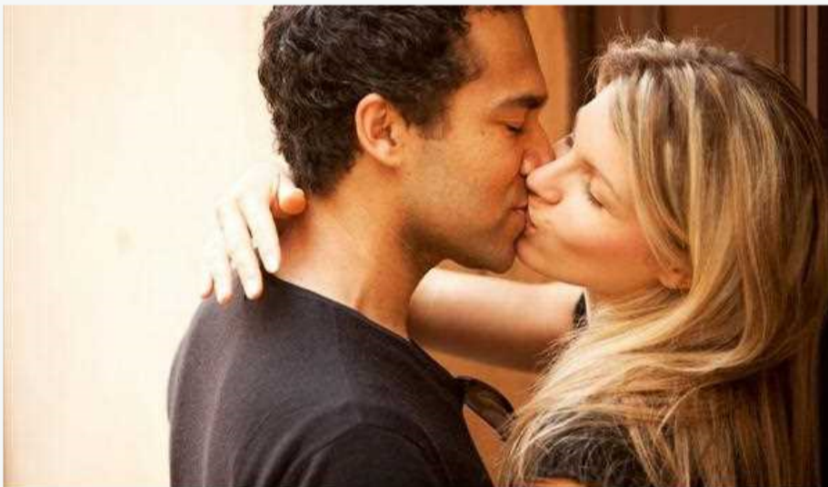
Pheromones Pheromone Perfume Dating Scene

Whenever you are out to meet brand-new and exciting people, you want to come with an atmosphere of trust around you so as to put them at ease and comfort. Only when this is performed, are you going to get the results you need when approaching or speaking with members of the opposing sex. This is what a lot of people fail to realize.