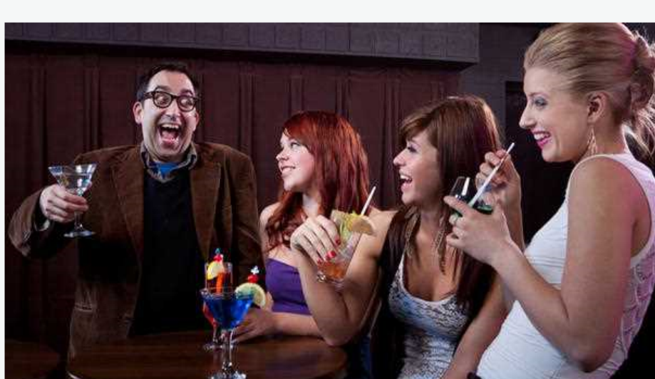
The Gilroy Scent

She seems like she is obtaining old and less fairly as well as wishes to be able to feel young and pleasing again